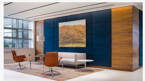
Our Headquarters in Ballsbridge, Dublin