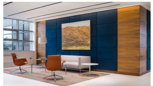
Our Headquarters in Ballsbridge, Dublin